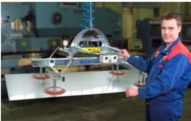
Dumbo vacuum lifter combined with Skanveir drawer sheet rack is an optimum solution for sheet handling.